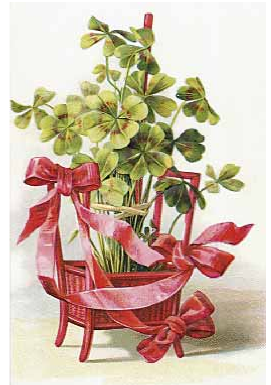
Right: Fig 3 An Easter card in the form of four-leaf clover tied with a red ribbon, c. 1900. Private Collection.