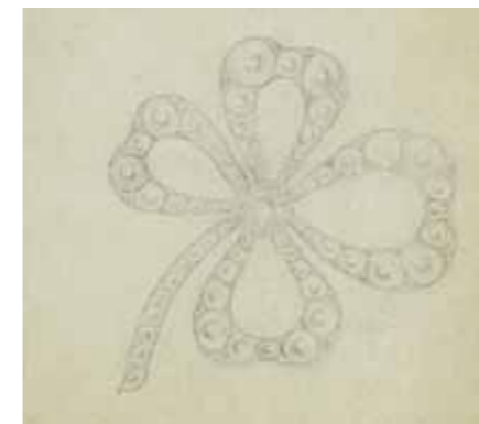
Opposite: Fig. 1 The Imperial Easter Egg of 1902 known as the Clover Egg in the form of four-leaf clover rendered in pique-à-jour enamel, diamonds and calibre rubies. Kremlin Armoury Museum, Moscow.

After the guns of two World Wars finally fell silent it was not only capital cities that had been leveled but also society and many of its customs. Later modern electronic advances,