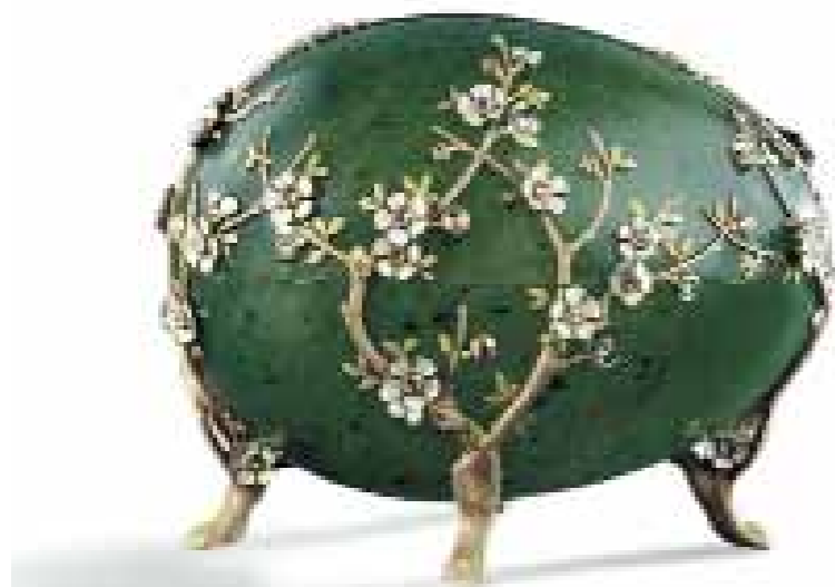
Fig 8 The Apple Blossom Egg made by Fabergé for Alexander Kelch in 1901. Siberian jade, coloured gold, enamel and foiled rose-cut diamonds