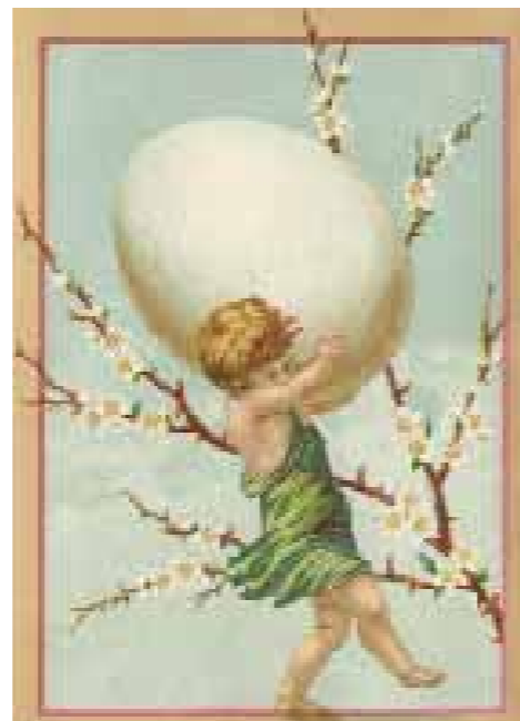
Fig 9 An Easter card in the form of a putto carrying an egg away from a spray of apple blossom. Printed in Germany, c.1900. Private collection

giver' and, flowering throughout the winter; it too is a favourite emblem for Easter greetings cards (fig 13). In jewellery design it usually appears with diamonds, for constancy, and then the message is extended to 'always think of the giver'. This is the unequivocal message of the Pansy Egg of 1899; a message endorsed by the heart-shaped frame housed within which is decorated with the lamps of love and garlands of roses for Venus (fig 12).