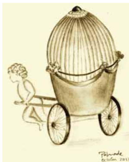
Fig 11 A drawing by Anna Palmade of the missing Imperial Easter Egg of 1888 called the Chariot Egg. This is based on the only evidence of its appearance; an indistinct photograph taken in March 1902 © Anna Palmade

It seems we must search elsewhere for aesthetic ancestry of this remarkable object. In Christian lore the swan, singing its dying breath, denotes Jesus's last cries to God from the cross and by extension the crucifixion, all martyrs and Christian resignation. These attributes perfectly suited to any Easter egg, even the most extravagant of those made by Fabergé (note 3). Although the mechanical concept of the Swan Egg has been given to the automaton by James Cox (c. 1723-1800) its aesthetic ancestry is likely to be composite. Enameled pale purple, the colour of religious devotion and set