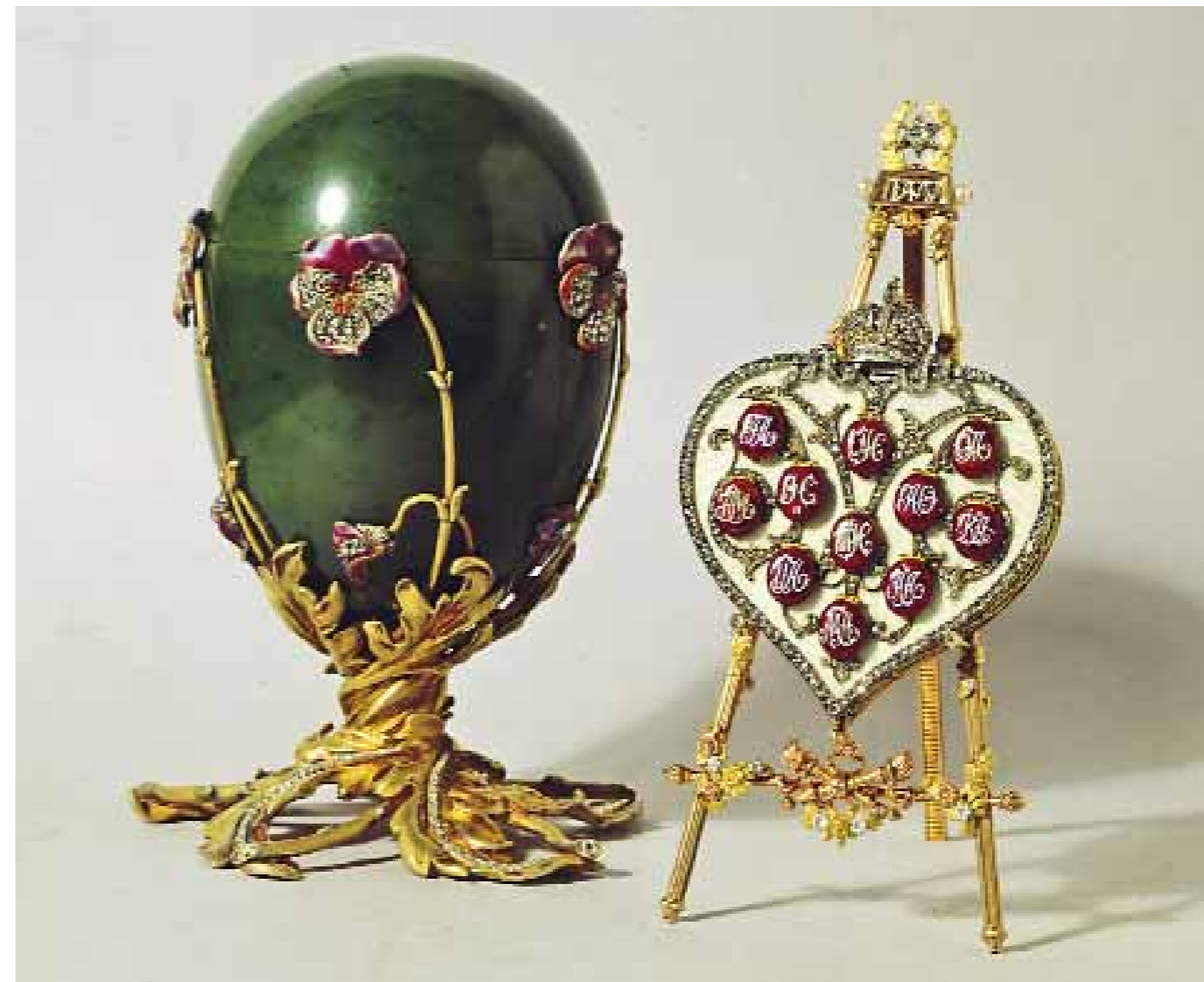
Fig 12 The Imperial Easter Egg of 1899. Nephrite, silver gilt, diamonds, and enamel. Private collection, USA