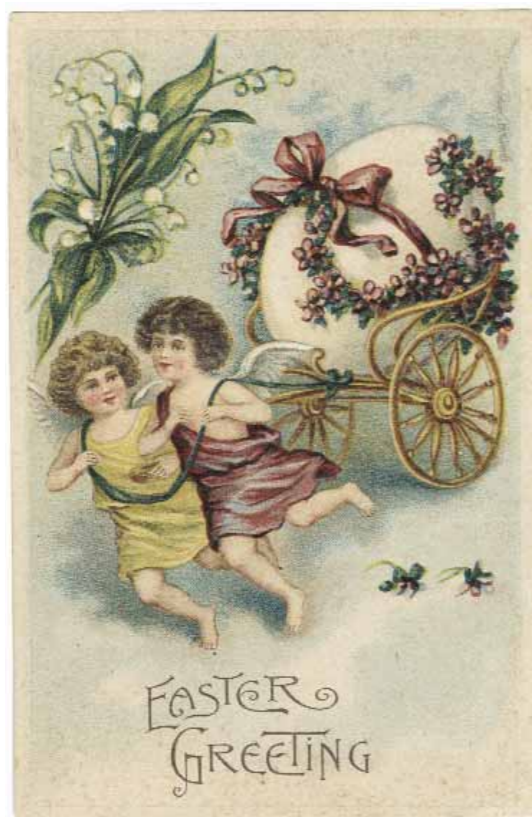
Fig 10 An Easter card in the form of a garlanded Easter egg in a chariot pulled by amorini. A bouquet of lilies of the valley is seen to the left. Made in Germany, c.1885. Author's collection

performed on December 22, 1905 and that was just too late to have inspired Fabergé's Swan Egg, which was delivered only months later at Easter 1906; nonetheless it demonstrates a significant confluence of ideas that may well derive from the popularity Tennyson's poem of 1893.